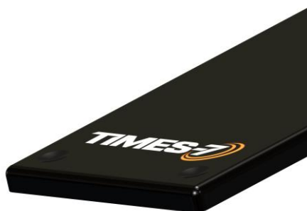
The SlimLine A8060 Antenna

The SlimLine A8060 is a unique, ultra-low profile linear flat panel UHF antenna. The durable A8060 easily transforms existing doorways into an RFID portal or read point. At just 8 mm / 0.3 " in thickness and with integrated mounting holes requiring no extra frames and mounting kits for installation, the A8060 is a portal antenna solution with absolutely no compromise on spatial dimensions. Versatile and good-looking, the A8060 works as a left, right and/or top antenna.